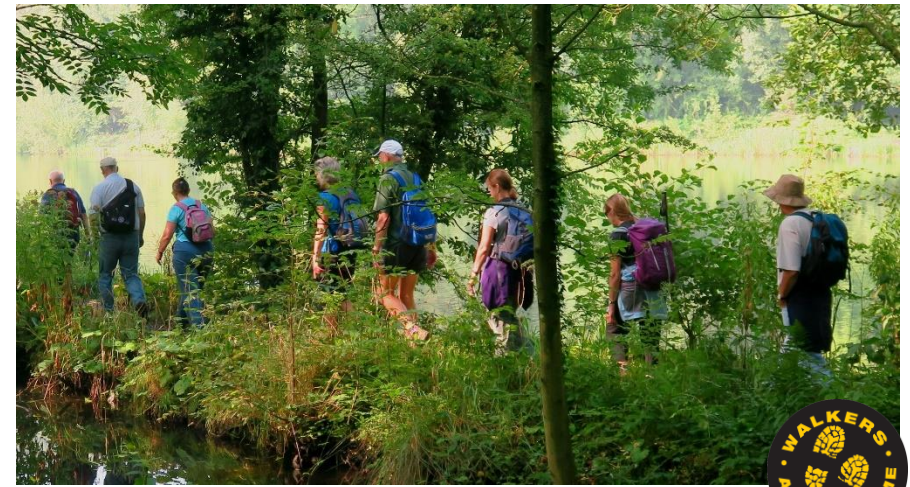
Little Dawley Pools, Wellington